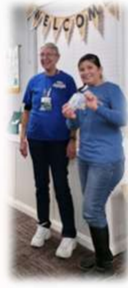
Maria Dykes Award for Service