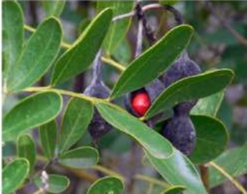
Sophora secundiflora (Ortega), "Texas Mountain Laurel"