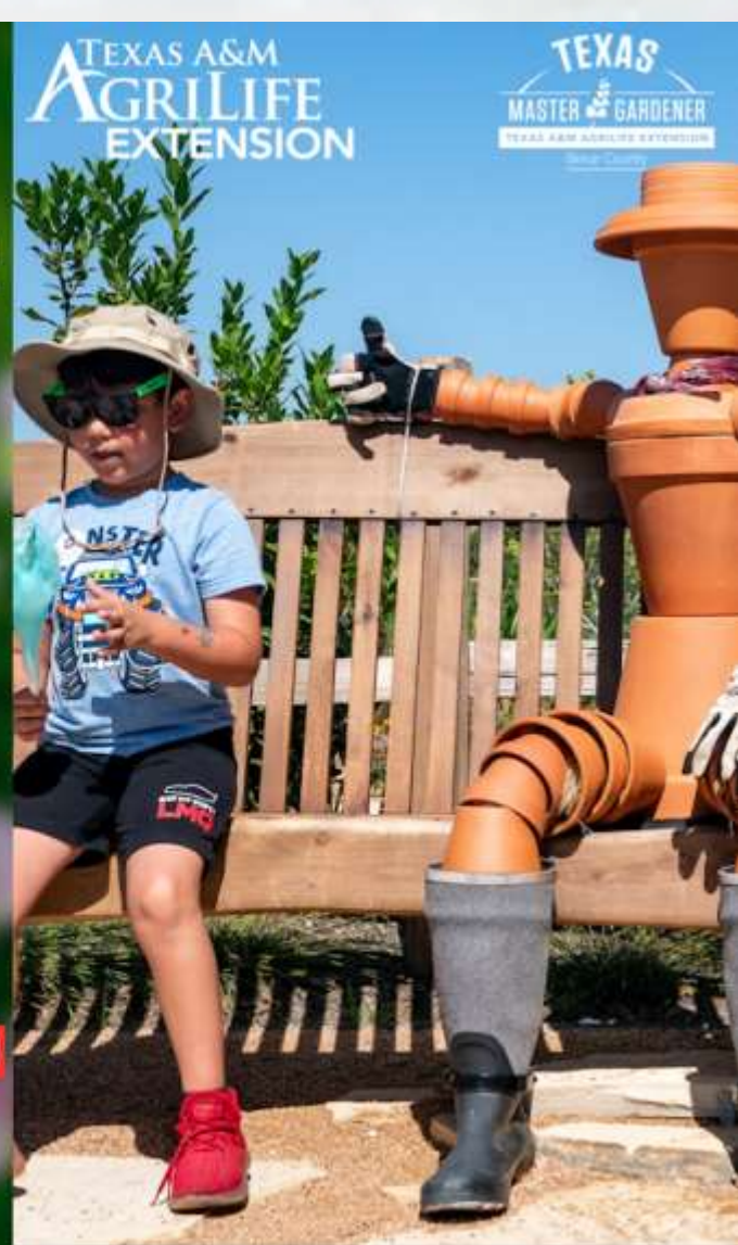
Texas A&M AgriLife Extension Service is an equal opportunity employer and program provider. Texas A&M AgriLife Extension Service provides equal opportunities in its programs and employment to all persons, regardless of race, color, sex, religion, national origin, disability, age, genetic information, veteran status, sexual orientation, or gender identity. The Texas A&M University System, U.S. Department of Aericulture, and the County Commissioners Courts of Texas Cooperatine.

For questions, contact andres.villagran@ag.tamu.edu